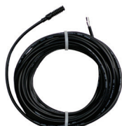
Battery Temp. Sensor