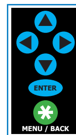
Programmable by key pad