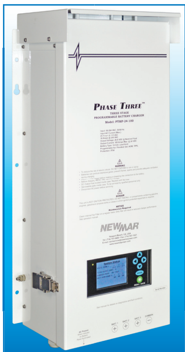
24 Volt, 150 Amp